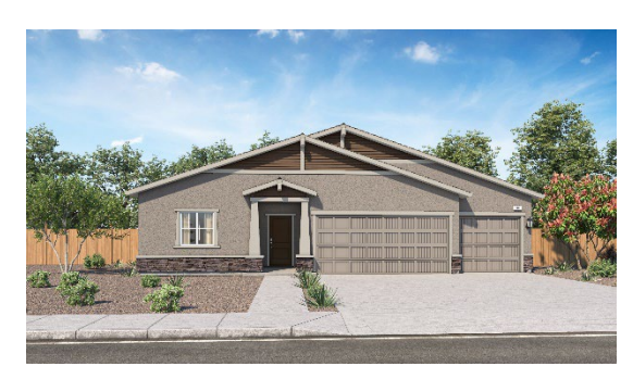
B - Craftsman