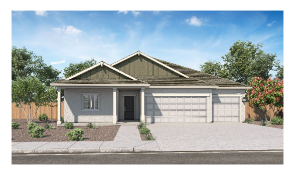
A - Farmhouse

2538 TISH TANG WAY REDDING, CA 96002 | DRHORTON.COM/SACRAMENTO