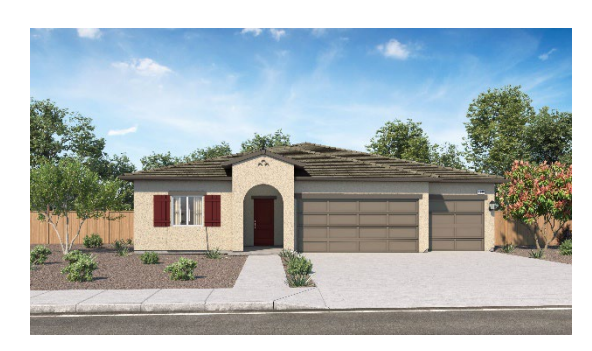
C - Mission